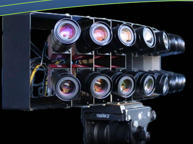
Multicamera system for super high resolution video that uses technology by Univ. of Hasselt

The first installations are at the cinema complex "Full HD" near Barcelona and in the Araujo Cinemas in Maringa, Brazil.